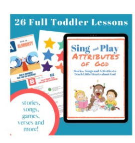
The Ultimate Toddler Bundle: Everything you need to teach age 1-3 about God