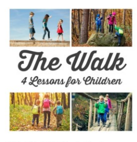
"The Walk" 4 Week Study on Following Jesus $29 $45