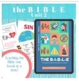
The BIBLE Unit 2: Nehemiah to Micah (13 Week Curriculum) from $97 $125