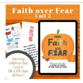
More FAITH Less FEAR: 4-Week Children's Ministry Curriculum (Unit 2 of Faith over Fear) $45