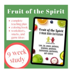
"The Fruit of the Spirit" 9 Unit Curriculum for Kids $57 $90