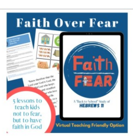
"Faith Over Fear" 5 Lesson Unit for Back-To-School from Hebrews 11